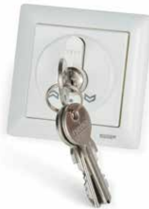
WSA 210 1161