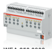
WEA 250 0802