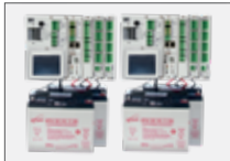
WSC 540 4 x WSA 017