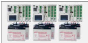
WSC 560 6 x WSA 017