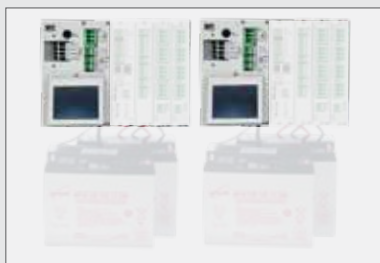
WSA 5PS power supply module – one module in each section