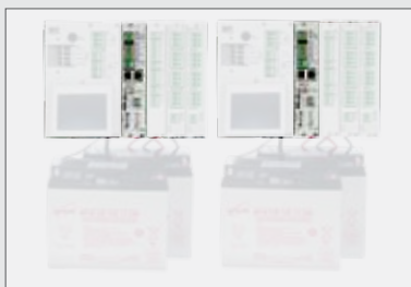
WSA 5MC overall control module – one module in each section