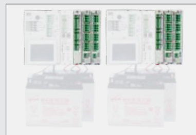
Free slots for connection of expansion modules type WSA 5IO, WSA 5SM and/or WSA 5ML – 3 free slots in each section